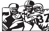
SUPER BOWL BASH

Colts or Saints, who will claim the trophy? Come join us to watch big game on our large screen TV's, February 7 at 5:00 PM in the Church Hall. It's a fun, family "potluck" event with a football pool and raffle